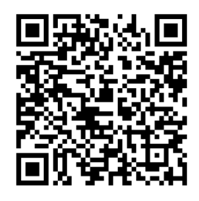
Scan for more information: