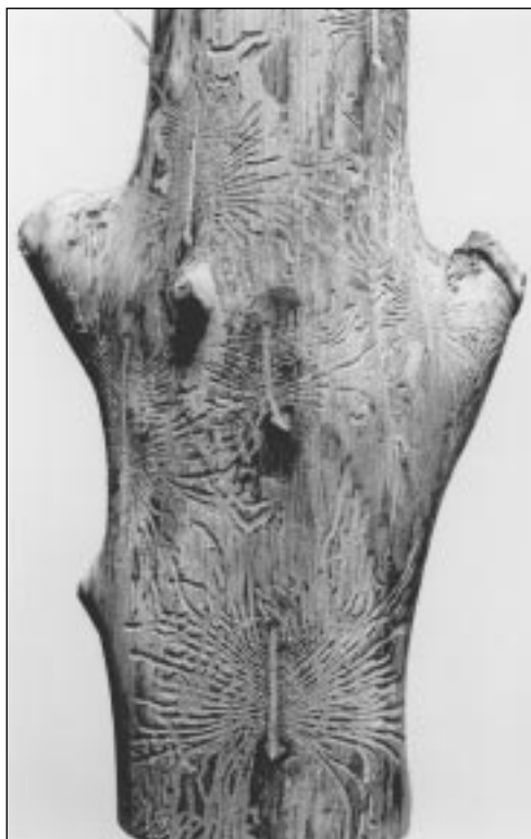
Egg galleries of the European elm bark beetle run parallel with the wood grain.