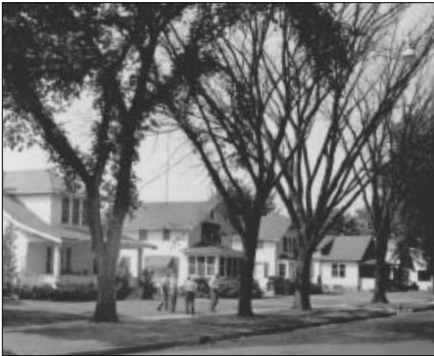
Disease often spreads from tree to tree along one side of the street through connecting roots.

The disease may spread rapidly throughout the tree, or it may take several years for the tree to die with just a few branches dying at a time. Some trees, in fact, may appear healthy for a time after the first symptoms have appeared. Occasionally the leaves are dwarfed and stunted.