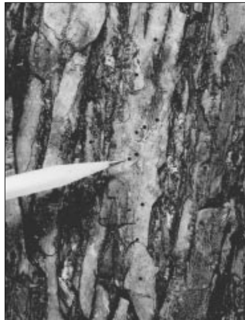
Holes in the bark produced by the emerging beetles.