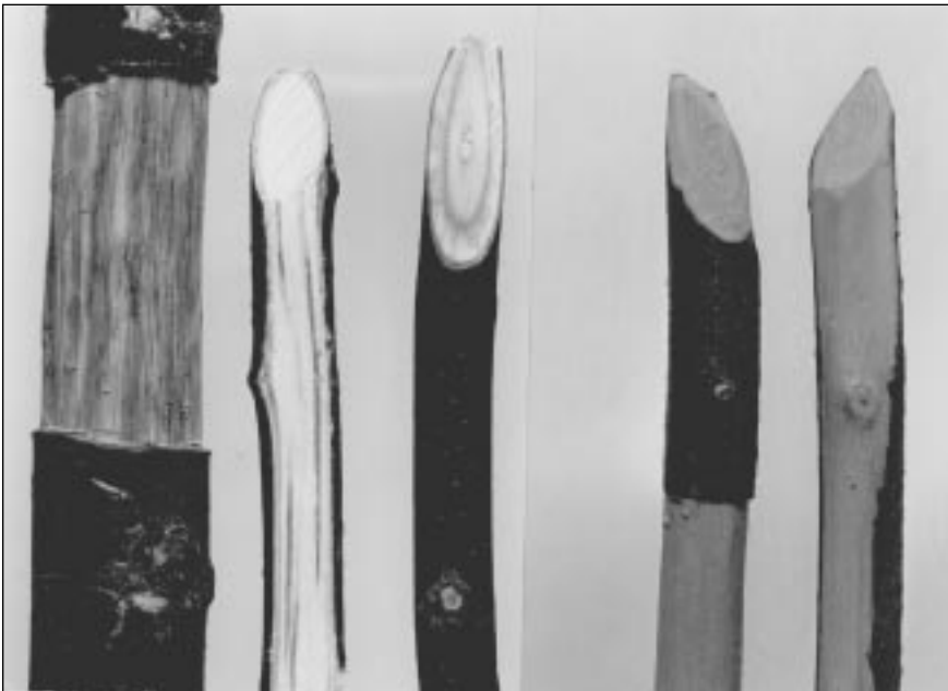
The brown discoloration of the wood just beneath the bark in the three branches is typical of internal symptoms of Dutch elm disease. The sapwood of the two healthy branches at the right appears white or light green in color.

In addition to elm protection, municipalities need to emphasize maintenance and care of trees other than elms and to have tree planting and replacement programs using diverse adapted tree species.