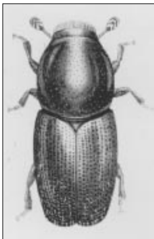
Native elm bark beetle.

Spread of the disease through root graft is a major cause of lost elms along city streets and other areas where elms grow near one another. Once a tree becomes infected by beetle feeding, it poses a serious threat to neighboring elms. Since Dutch elm disease is a vascular disease, the fungus moves through connecting roots (root grafts) into surrounding healthy elms as a diseased elm dies.