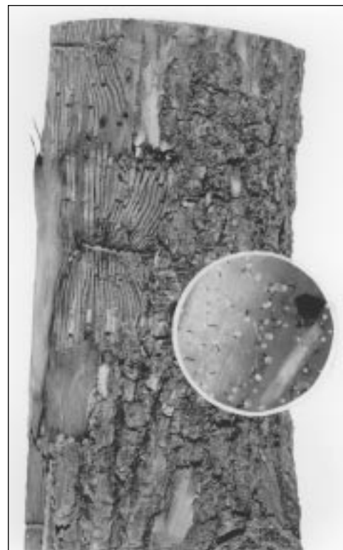
The egg galleries of native bark beetles run across the wood grain. The fungus (enlarged) grows abundantly in the galleries. Beetles are easily contaminated by these sticky spores.