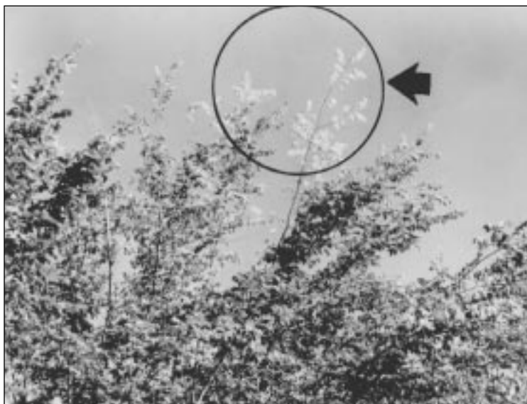
Early symptoms of Dutch elm disease often appear in small branches as yellow or brown leaves. Treating the disease at this stage gives the tree the best chance for survival.

Confirmation of the disease is usually possible by laboratory culturing of the fungus. The Wisconsin Department of Agriculture, Plant Industry Laboratory, 4702 University Avenue, Madison, Wisconsin 53705, will process specimens submitted from June through August. Confirmation is sometimes easier with isolations made in early summer.