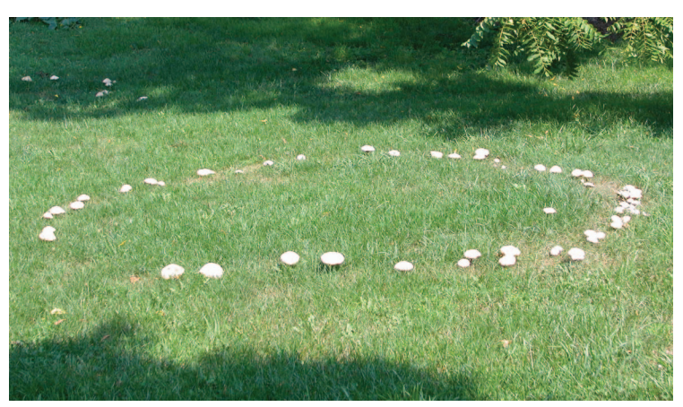
Figure 8a. Fairy ring on a home lawn with mushrooms of the causal fungus.