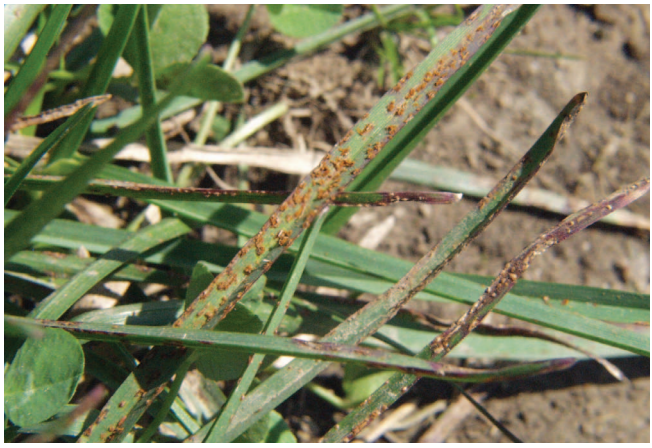
Figure 17a. Rust pustules on Kentucky bluegrass leaves.