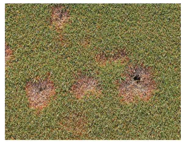
Figure 4a. Bentgrass dead spot patches have tan centers with reddish-brown margins.