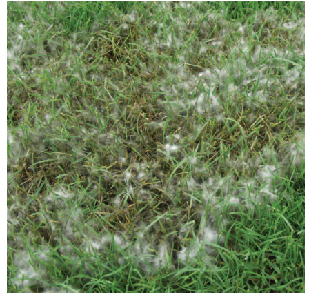
Figure 15a. Cottony mycelium of active Pythium blight on perennial ryegrass.