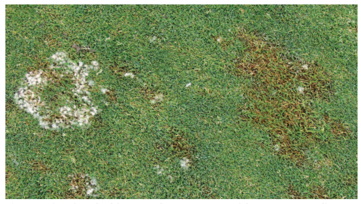
Figure 11b. Microdochium patch may appear with cottony mycelium (left) or as water-soaked patches (right) during cool, wet periods. Patches turn pink as they age.

Figure 12. Kentucky bluegrass landscape turf affected by necrotic ring spot illustrating characteristic frog-eye patches.