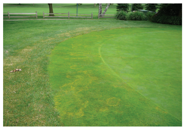
Figure 6a. Stand symptoms of brown ring patch on an annual bluegrass putting green and collar.

Cultural control: Fertilize with nitrogen and/or iron products to mask symptoms. Aerify and topdress to limit thatch production.