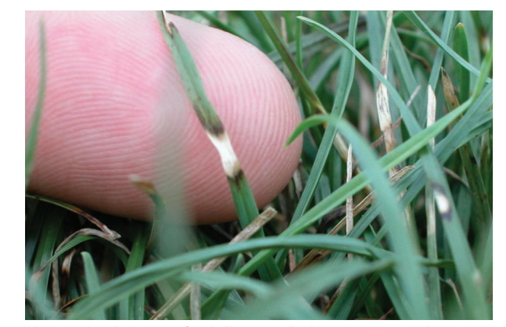
Figure 7b. Close-up of a dollar spot lesion on a Kentucky bluegrass leaf. The bleached white center and reddish-brown border of the lesion are characteristic of the disease.