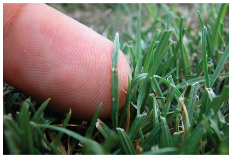
Figure 9c. Gray leaf spot lesions on a perennial ryegrass leaf blade. Note the greenish brown margins and light gray centers of the lesions.