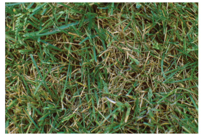
Figure 19a. Kentucky bluegrass lawn with ragged symptoms of stripe smut.