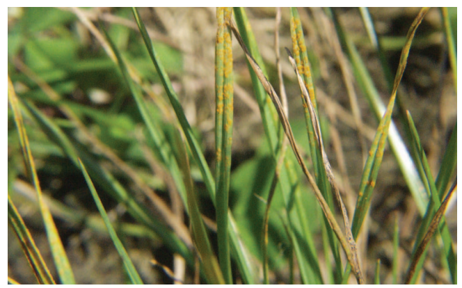
Figure 17b. Rust pustules on perennial ryegrass leaves.