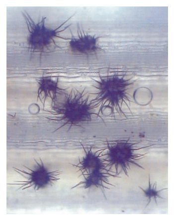
Figure 2b. Close-up of the reproductive structures of the anthracnose pathogen on a leaf showing the characteristic black setae (hair-like structures).