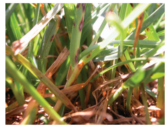
Figure 10a. Leaf lesions of melting-out on Kentucky bluegrass maintained at landscape height.