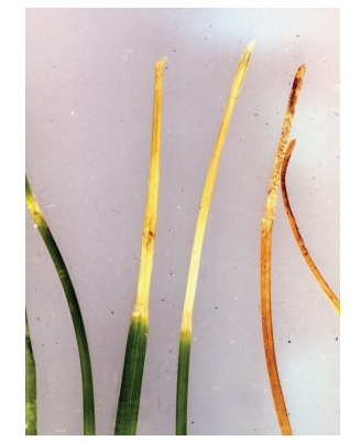
Figure 3. Tip dieback symptoms of Septoria leaf spot on Kentucky bluegrass leaves showing the minute black fruiting structures of the pathogen.