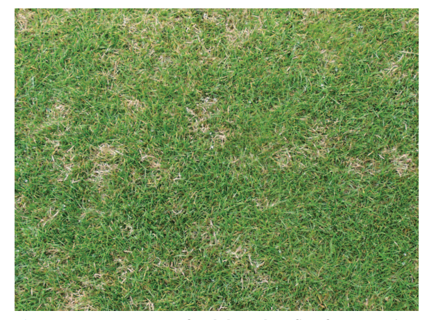
Figure 16a. Symptoms of red thread on fine fescue maintained at fairway height. Note the similarity of these symptoms with dollar spot on closely mown grasses.