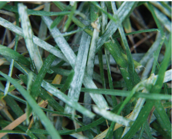
Figure 14a. Close-up of Kentucky bluegrass leaf blades covered with the white mycelium of the powdery mildew pathogen.

Cultural control: Increasing light conditions and air circulation by pruning trees and shrubs will minimize the occurrence of powdery mildew. Plant resistant cultivars of Kentucky bluegrass or a more shade-tolerant species of turfgrass such as a fine-leaved fescue.