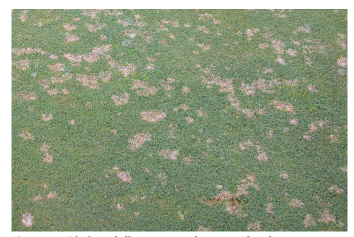
Figure 7c. Distinct dollar spot patches on a closely mown creeping bentgrass putting green.