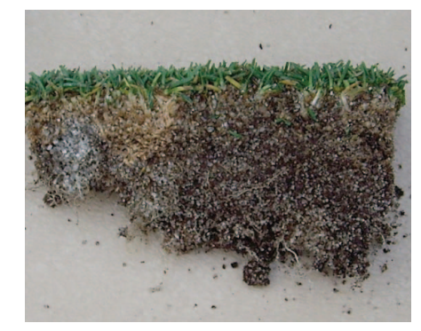
Figure 6b. Brown ring patch causes thatch degradation, a common diagnostic feature of this disease. This fungus lives primarily in the thatch and is similar to fairy ring fungus.