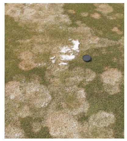
Figure 22a. Distinct, round patches of Typhula blight on a creeping bentgrass fairway 1 week after snow melt.