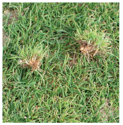
Figure 24. Yellow tufts that have been easily pulled from the soil, showing the multiple chlorotic shoots/tillers emanating from a single crown.