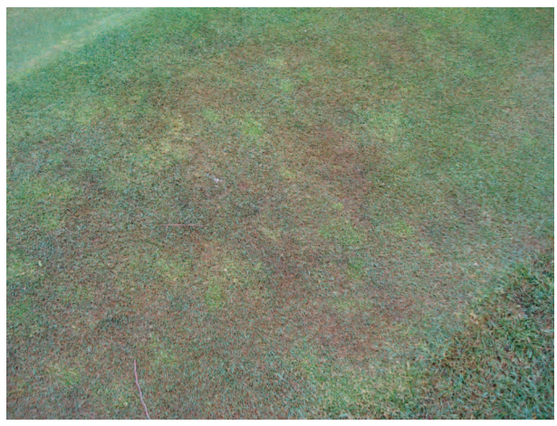
Figure 10c. Stand symptions of Bipolaris leaf spot on a creeping fairway.