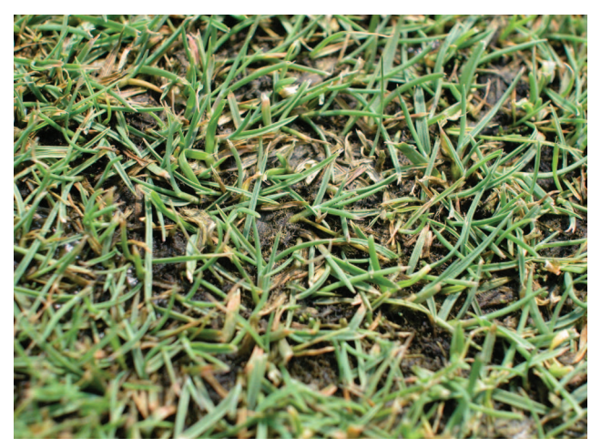
Figure 1. Dark-colored algal slime among creeping bentgrass plants on a golf course tee.