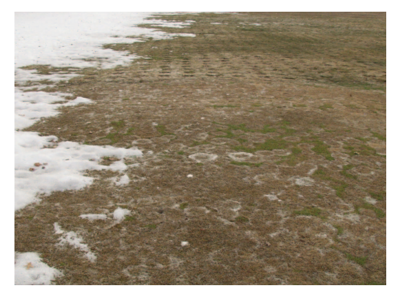
Figure 22b. Patches of Typhula blight revealed at snow melt.