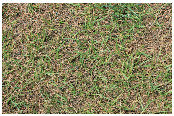
Figure 9b. Characteristic twisted appearance of perennial ryegrass blades affected by gray leaf spot.