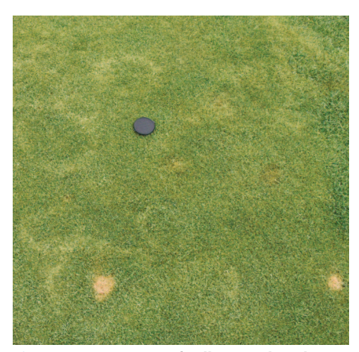
Figure 23. Symptoms of yellow patch on bentgrasses maintained at fairway height.