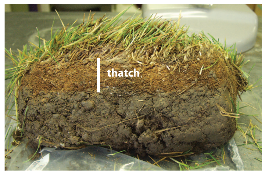
Thatch provides a beneficial cushion for turf plants and should be maintained at ^{1\!/}\!4\text{--}1 inch thick.

A good rule of thumb for the water requirement of landscape turf is approximately 1 inch per week. This requirement may need to be increased during hot, dry periods, and decreased when it is very cool and when there is frequent precipitation. High-maintenance landscape turfgrasses that are watered during dry periods should be done so infrequently and deeply (3–4 inches in depth, 1 to 2 times per week) to promote deep rooting and reduce the duration of leaf wetness. The longer a particular turfgrass leaf remains wet, the more susceptible it is to attack by foliar pathogens.