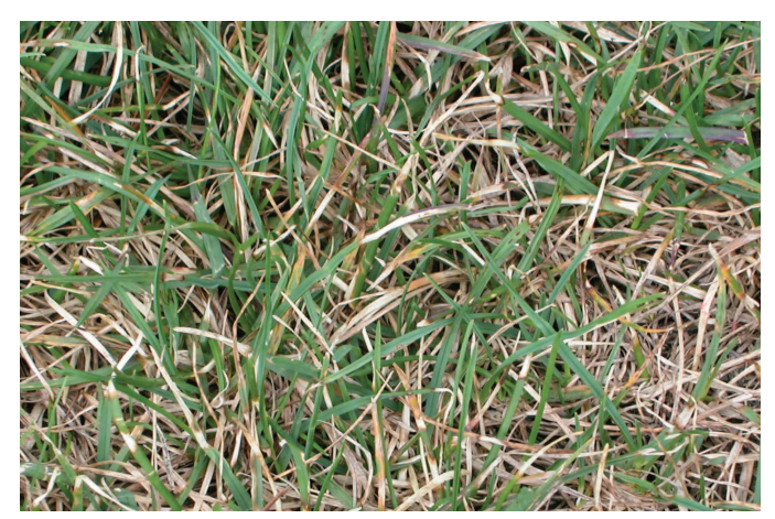
Figure 7a. Dollar spot on Kentucky bluegrass maintained at landscape height. Note the diffuse patches on taller turf.