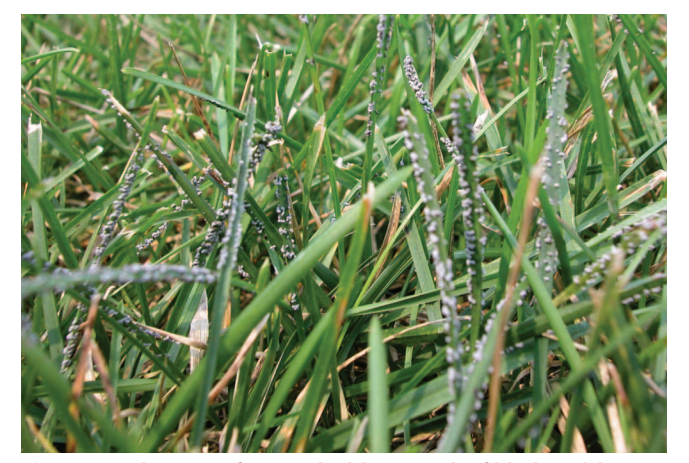
Figure 18. Close-up of Kentucky bluegrass leaf blades with purplish slime mold structures.

Cultural control: Maintain balanced fertility and adequate moisture during warm, dry periods. Once a plant is colonized by the pathogen, it will be colonized for the remainder of the plant's life. Therefore, overseeding the affected area with resistant cultivars is recommended (see www.ntep.org for a current list).