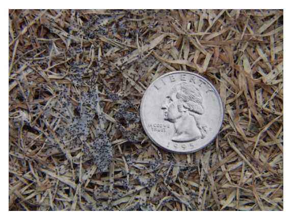
Figure 22c. Small, black sclerotia of one of the Typhula blight fungi ( Typhula ishikariensis ) on the surface of colonized creeping bentgrass leaves.