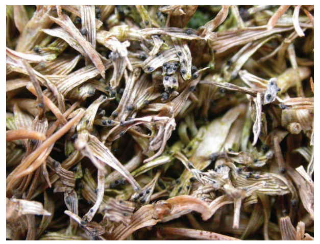
Figure 4b. Minute black fruiting structures of the bentgrass dead spot pathogen on necrotic bentgrass leaves.