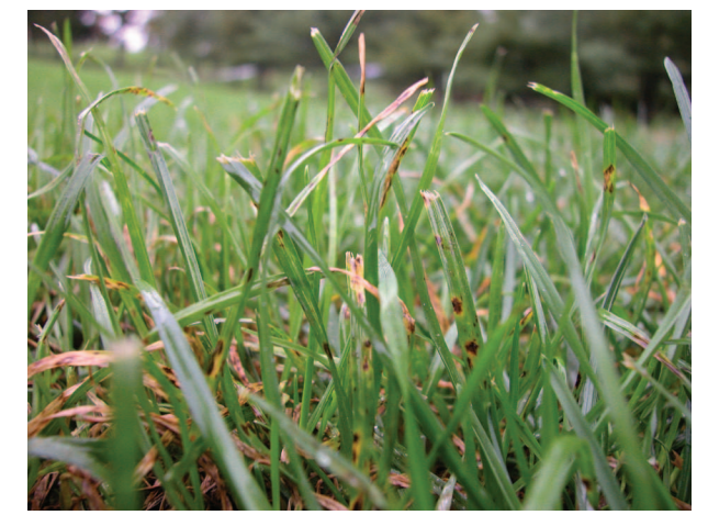
Figure 10b. Leaf lesions of leaf spot on perennial ryegrass maintained at landscape height.