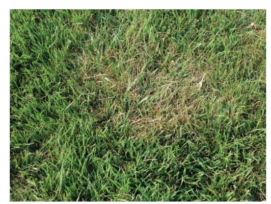
Figure 5b. Diffuse patch of brown patch on landscape turfgrasses.