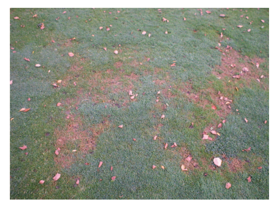
Figure 2a. Chlorotic annual bluegrass affected by anthracnose in an annual bluegrass/creeping bentgrass fairway.