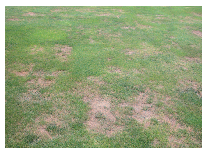
Figure 9a. Drought-like symptoms of gray leaf spot on a perennial ryegrass golf course fairway.