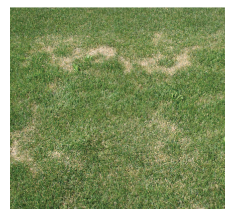
Figure 20. Kentucky bluegrass landscape turf affected by summer patch illustrating characteristic frog-eye patches.