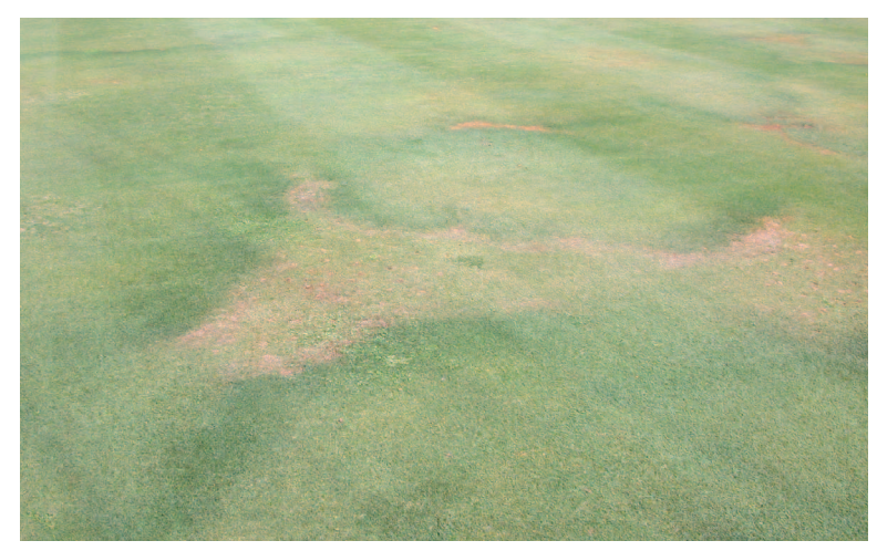
Figure 8b. Dark-green fairy rings on a creeping bentgrass green. The brown area where the rings converge is hydrophobic (repels water).