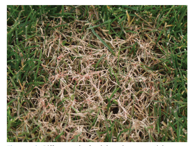
Figure 16b. Diffuse patch of red thread on perennial ryegrass maintained at golf course fairway height.