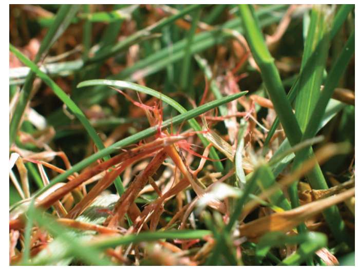
Figure 16c. Close-up of perennial ryegrass blades with tendrils of the red thread pathogen emerging from colonized leaves.