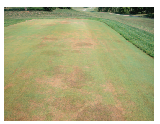
Figure 5a. Distinct patch of brown patch on a creeping bentgrass putting green. Note the purplish margin of the patch.