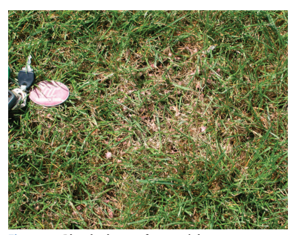
Figure 13. Bleached area of perennial ryegrass affected by pink patch. Note the diffuse nature of the patch.