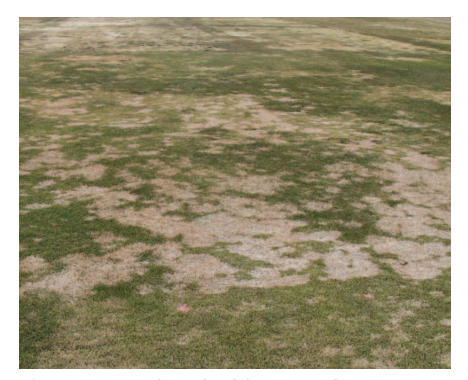
Figure 11a. Microdochium patch on an annual bluegrass/Kentucky bluegrass fairway following snow melt. No sclerotia are found on turfgrasses affected by this disease, unlike for other snow mold fungi.