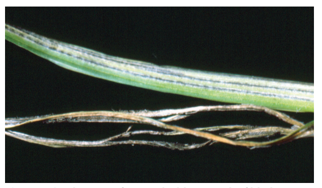
Figure 19b. Close-up of Kentucky bluegrass leaf blades showing the black pustules and leaf shredding caused by the stripe smut pathogen.