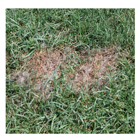
Figure 15b. A Pythium blight patch that has begun to dry out in the afternoon sun.