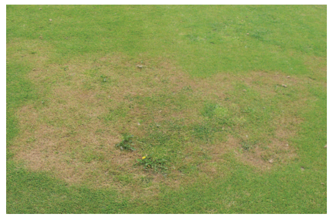
Figure 21b. Take-all patch on a creeping bentgrass fairway 3 years after establishment. Note the weeds growing in affected areas.