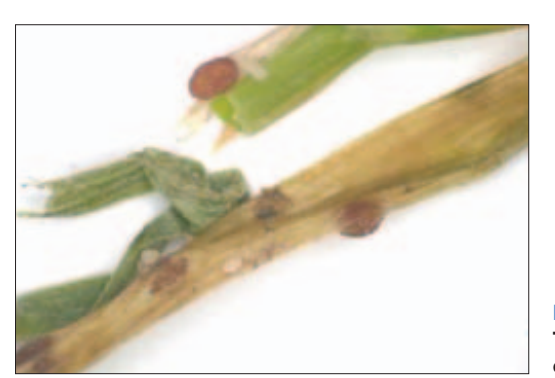
Figure 22d. Reddish brown sclerotia of one of the Typhula blight fungi ( Typhula incarnata ) on the surface of colonized creeping bentgrass leaves.