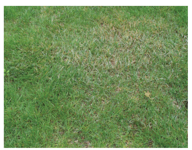
Figure 14b. Shaded Kentucky bluegrass landscape turf with a white cast caused by powdery mildew.