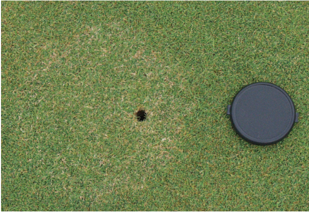
Figure 21a. Early symptoms of take-all patch on a creeping bentgrass putting green 1 year after establishment.