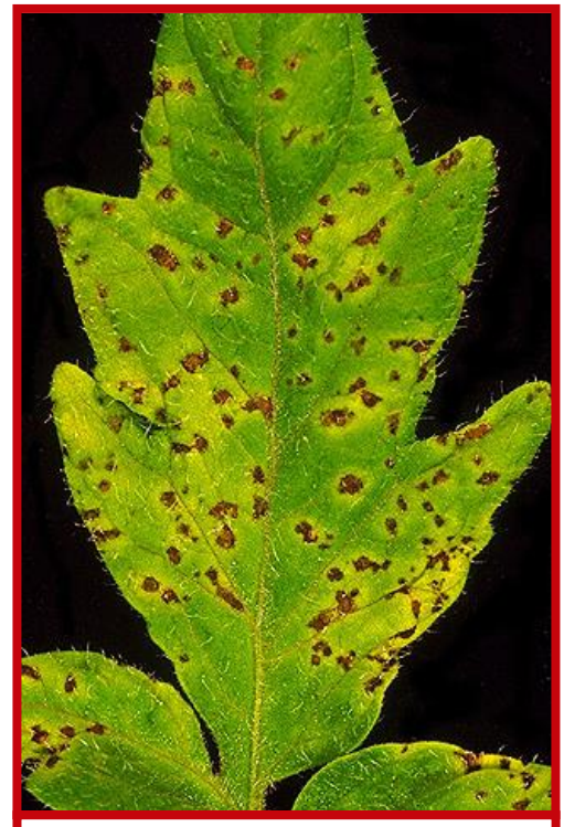
On tomato leaves, bacterial speck leads to small, angular (i.e., straightedged) spots with yellow haloes.

still like to use it (e.g., it's a favorite variety with difficult-to-find seed), consider treating the seed in hot water prior to planting to eliminate the pathogen. Treat seed with 122°F water