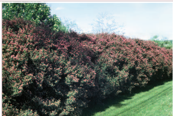
Invasive exotic honeysuckles have been used as a hedge shrub due to their ornamental characteristics and form, but should not be used due to their invasiveness.

Invasive exotic honeysuckles range from southern New England and Canada south into North Carolina, west to the Great Plains and north into the Midwest. They often invade woodlands, especially those that are grazed or disturbed. They can also occur along lakeshores, forest edges, abandoned fields, pastures, roadsides, and other open, upland habitats. Morrow's and Bell's honeysuckle can also invade sand plains, bogs and fens. These honeysuckles can live under a broad range of light and moisture conditions, as well as in many different plant communities. However, they do not perform as well in shady environments. Large, urban areas are often invaded by honeysuckles. However, rural infestations have occurred where honeysuckles have been introduced to provide wildlife cover and food.