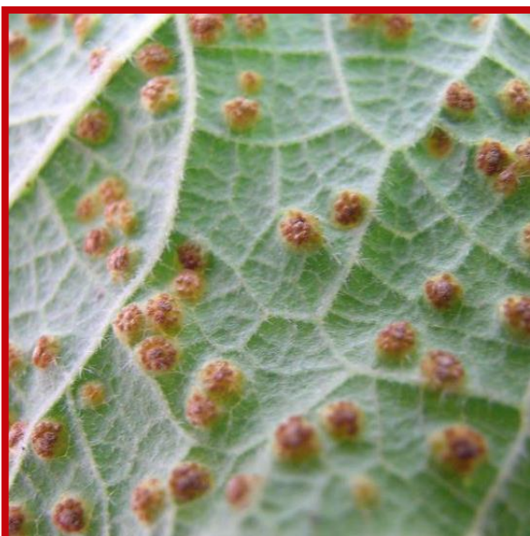
Brown to dark-red bumps on the undersurface of leaves is typical of hollyhock rust.

tebuconazole and triticonazole have similar modes of action and should NOT be alternated with one another. Be sure to read and follow all label instructions of the fungicides that you select to ensure that you use products in the safest and most effective manner possible.