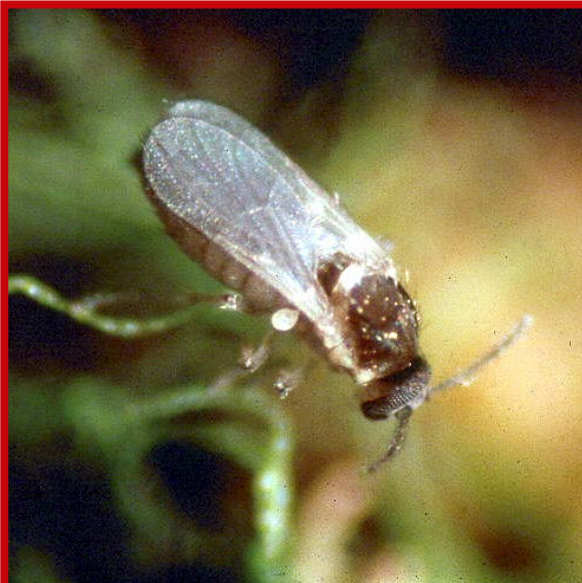
A fungus gnat.

Shore flies ( Scatella stagnalis ) are another nuisance insect that is often confused with fungus gnats in the greenhouse. Unlike fungus gnats, they feed on algae and are a problem in greenhouses with standing water on or beneath the benches.