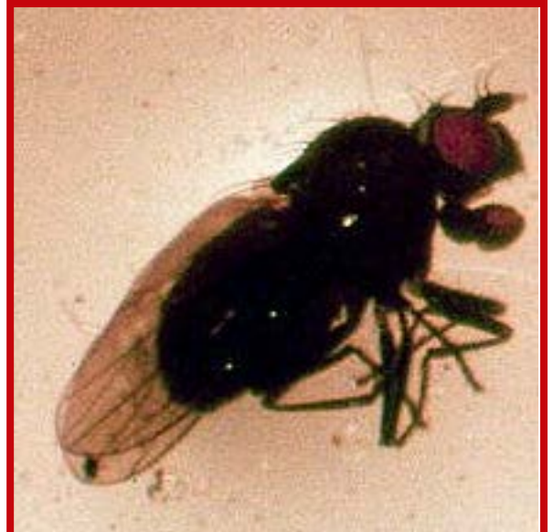
A shore fly.

Appearance: Adult fungus gnats are dark brown or black, delicate flies that are \frac{3}{16} inch long and resemble mosquitoes. The larvae are slender maggots that reach \frac{1}{4} inch when fully grown. The larvae are whitish or translucent with a black head capsule.