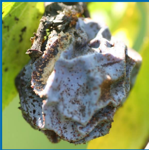
Fruits with brown rot eventually shrivel and dry forming a structure called a mummy.

How do I avoid problems with brown rot in the future? Remove and destroy any wild or volunteer Prunus trees and shrubs on your property, as well as all rotting and mummified Prunus fruits, as these can be reservoirs for brown rot fungi. Burn (where allowed by local ordinance) or deep bury these materials. Thin your Prunus trees to increase air flow and promote more rapid drying of twigs and fruits. See University of Wisconsin Bulletin A3629, "Growing Apricots, Cherries, Peaches, and Plums in Wisconsin" (available at http://learningstore.uwex.edu ) for information on how and when to prune. Be sure to decontaminate cutting tools after tree/shrub removal and pruning as described above. Carefully handle fruits during harvest to minimize bruising and store fruits in a cool, not overly wet environment.