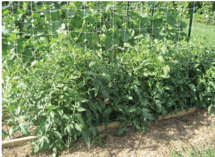
Nylon mesh supporting tomato vines

For more information on crop rotation, see "Crop Rotation in the Vegetable Garden": http://urbanext.illinois.edu/gardenerscorner/issue_04/04_winter_05.html