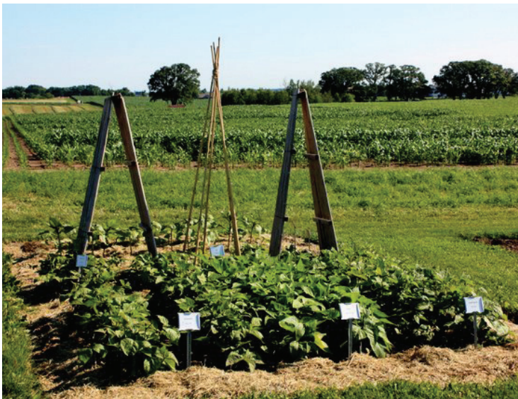
Tripod formed by stakes tied together

Vines can be tied to single stakes, or three of four stakes can be grouped and secured at the top to form a tripod structure, with vines trained to climb each pole. Another method is to weave a wire, cording, or wood such as saplings and branches between the tripod stakes and train vines to climb along the woven material and up the tripod structure.