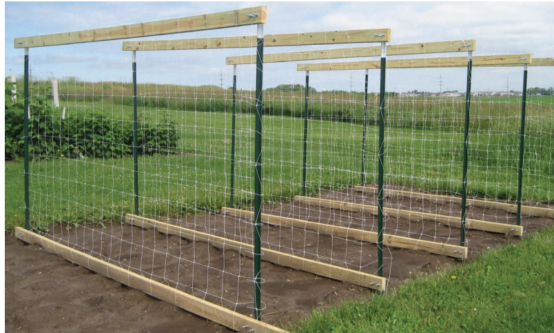
Vertical trellis using nylon mesh for supporting vegetables

Another trellising method uses nylon mesh or hog wire with 4-inch square grid. Either material can be attached to the upright stakes and upper supports to provide trellising. With this method as well, use ties or clips to train the vines to the mesh as they grow. When using wire mesh for trellising, check that the fruit does not imbed itself into the wire.