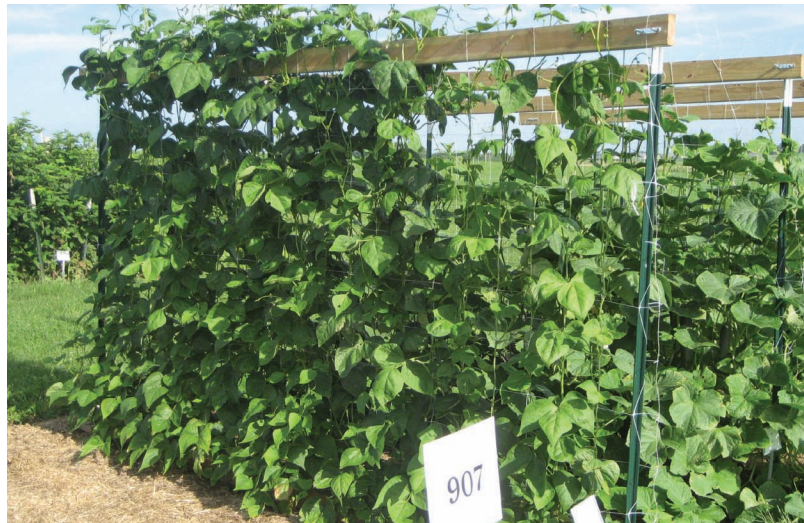
Nylon mesh supporting cucumbers