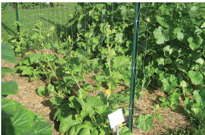
Cucumbers grown on a trellis

Some of the vine-type vegetables that grow best on supports are legumes such as pole beans and peas, tomatoes, cucumbers, gourds, melons, and squashes. Most vines grow strong enough to support the fruit they bear and increase in strength as the fruit get heavier. Larger fruit such as melons may benefit from a mesh bag or nylon socks for additional support. Supporting the vines with a proper structure is more important than supporting individual fruits.