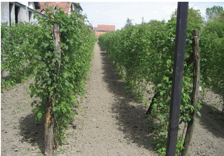
Weak-caned raspberries attached to a vertical trellis